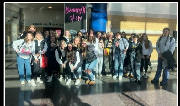
Arts & Culture /Health and Wellness/ Hospitality and Tourism Career Exploration BeautyX trade show