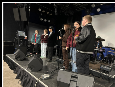
Arts & Culture SHSM Reach Ahead and Certification - Metalworks Institute